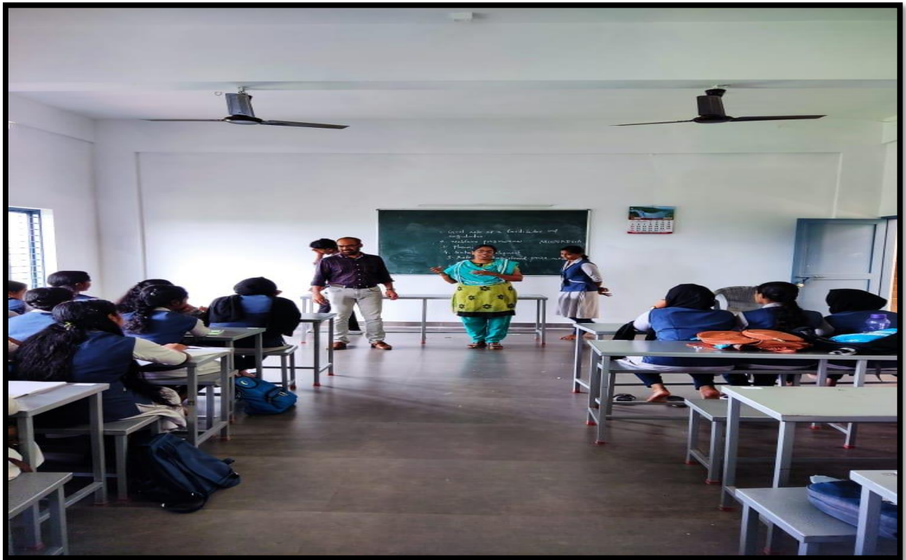
Giving awareness among the students

The outcome of the program was the successful registration of new voters in the Kadampazhipuram Panchayath area, and the creation of awareness about the importance of voting. The benefit of the program was the empowerment of citizens through voter registration, and the promotion of democratic values and civic engagement.