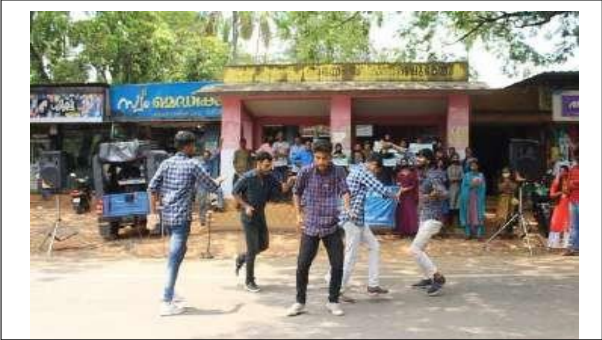
Flash Mob at Kadampazhipuram