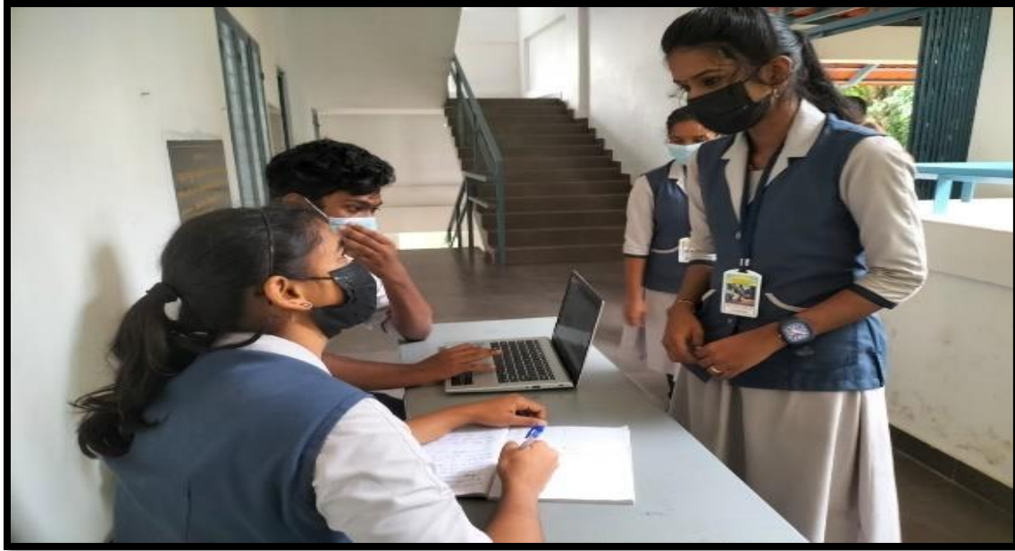
Registering new voters