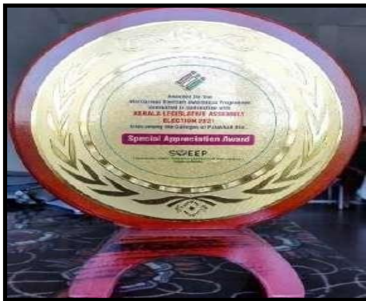
SVEEP award for election awareness programs 30/03/2020