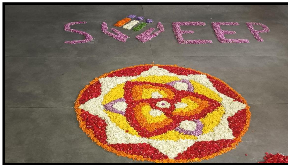
Onappookkalam by Electoral Literacy Club (ELC)