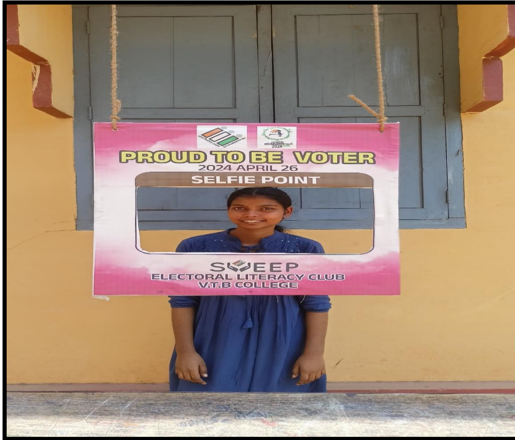
Selfie Point of Voter