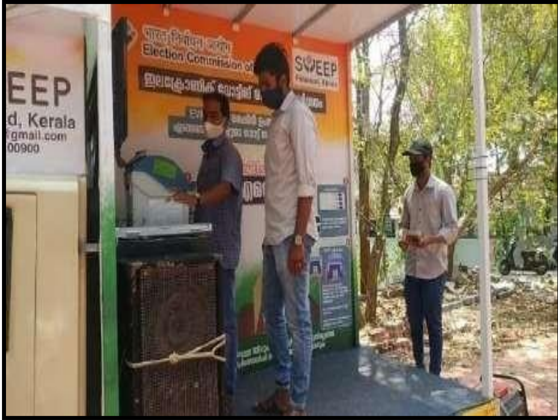
Travelling Awareness Programme with 'VotuVandi' to educate how to cast vote in electronic machine organized by SVEEP Palakkad.