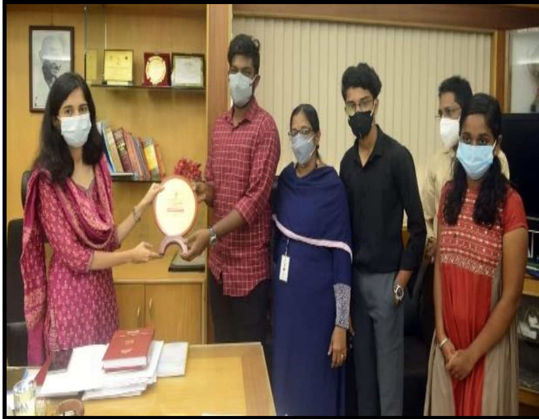
Receiving appreciation award from District Collector for the valuable contributions by NSS Volunteers towards SVEEP Initiatives