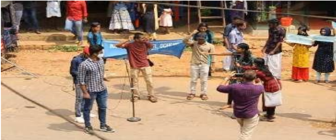
Street Drama for Awareness in association with SVEEP Palakkad

The outcome of the programme was an informed and engaged citizenry, equipped to exercise their right to vote responsibly, promote democratic values, and contribute to a healthy and functioning democracy. Ultimately, the event contributed to good governance and a better society, achieving its objectives and making a lasting impact on the participants and the community at large