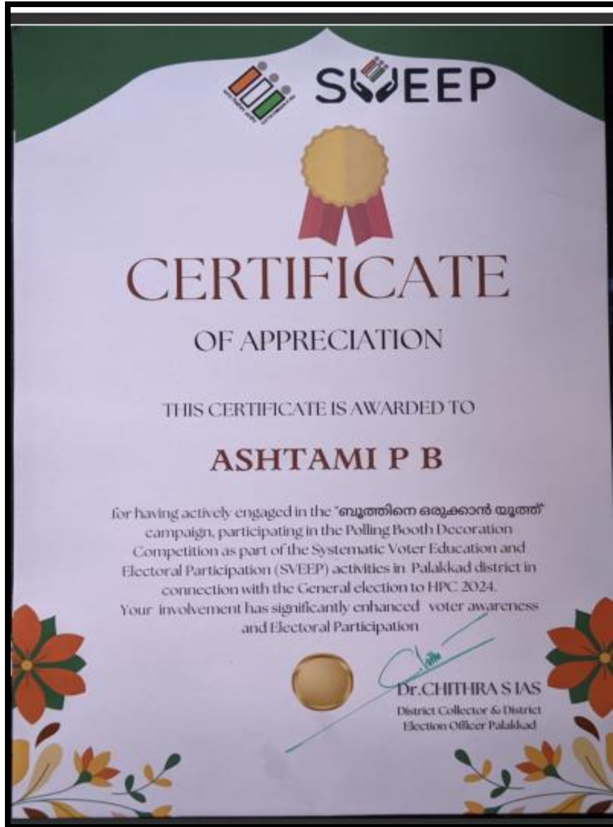
Certificate of Appreciation from the District Collector